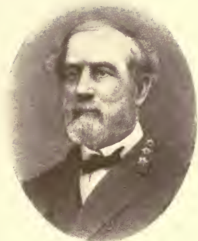
ROBERT E. LEE.